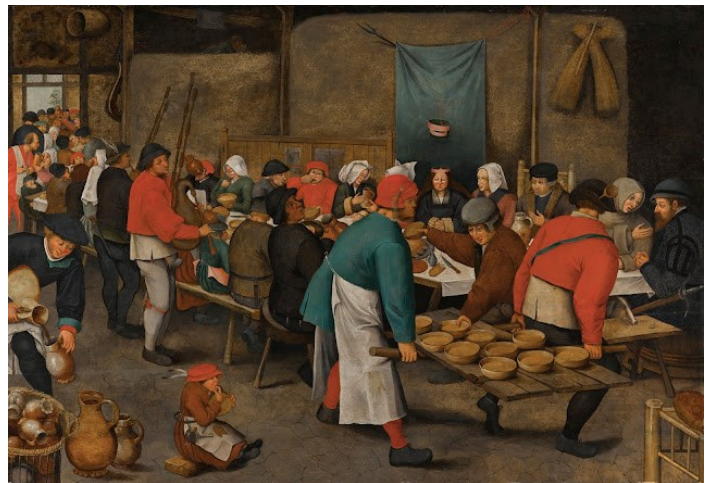
The Wedding Feast