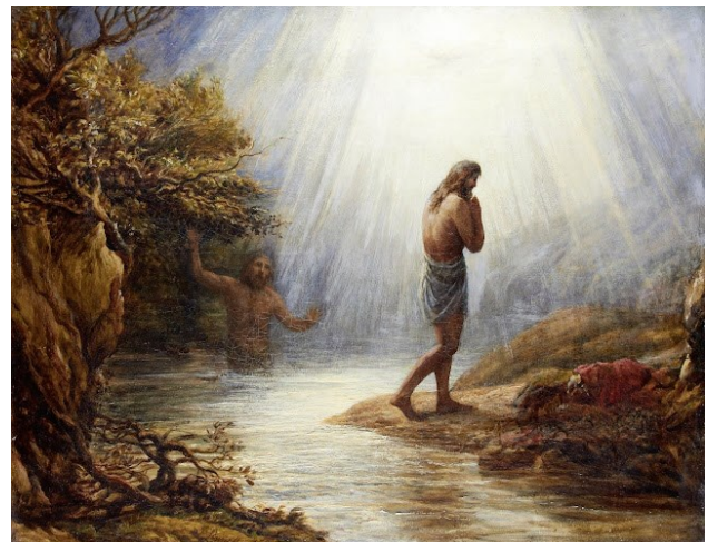
Saint John the Baptist