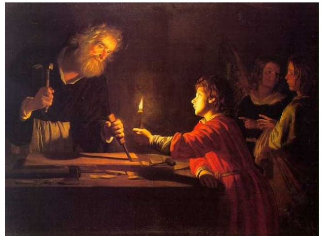
The Young Jesus

Gerard (Gerrit) van Honthorst 1590 – 1656