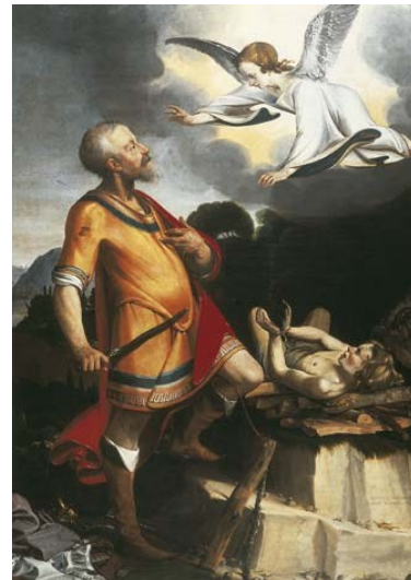
Sacrifice of Isaac