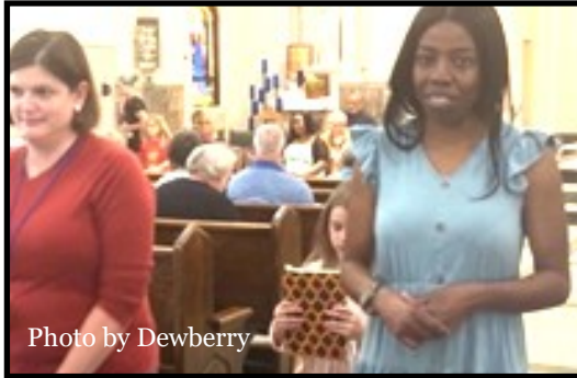
Teachers of Children's Liturgy of the Word