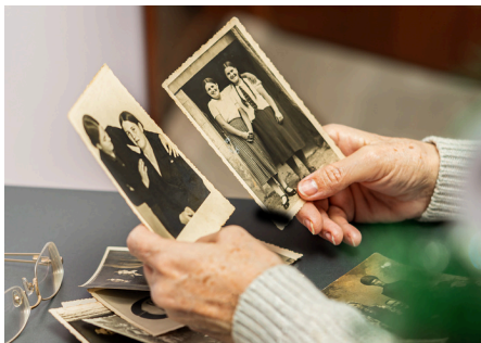
Table of Remembrance

This Sunday, Nov. 2 nd , our Table of Remembrance will be up. You are invited to bring prayer cards, photos, or remembrances of your family members or friends who have passed away. The Table will be up for the first 4 Sundays of November.