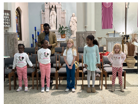
The Children's Christmas Choir is practicing for the Christmas Eve Mass