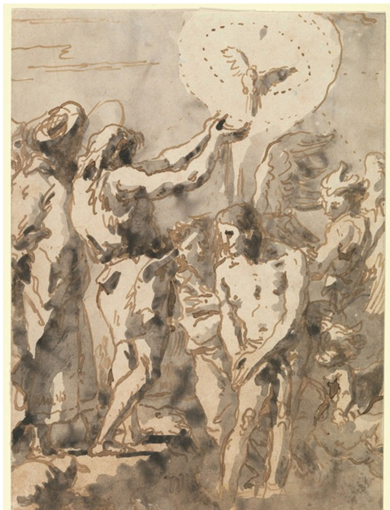
The Baptism of Christ

Small enough to know your name | Big enough to make a difference