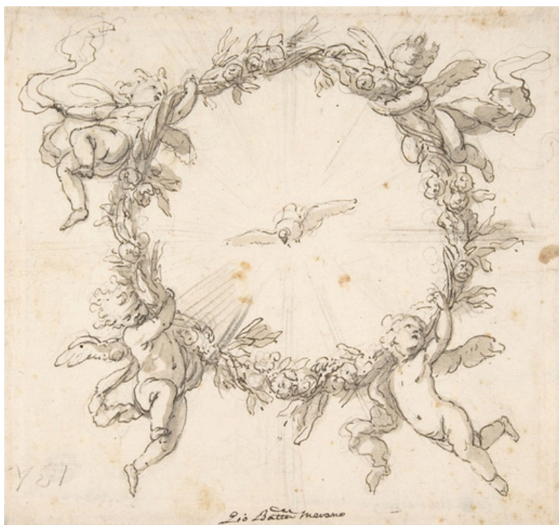
The Holy Spirit Surrounded by a Wreath of Flowers Held up by Infant Angels (1632–98) Giovanni Battista Merano

Small enough to know your name | Big enough to make a difference