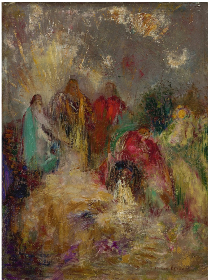
Le Christ et ses disciples ~ Odilon Redon

Small enough to know your name | Big enough to make a difference